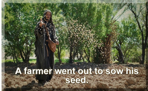
A farmer went out to sow his seed.